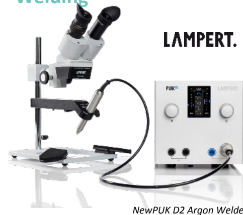
New PUK D2 Argon Welder

The highest degree of functionality has been combined with outstanding design. The result is a precision Argon Welder that is not only suitable for everyday use, but also optically and technically fulfils all requirements. Affordable, time saving, easy to use and Made in Germany. You will pay for the unit very quickly in saved solder cost.