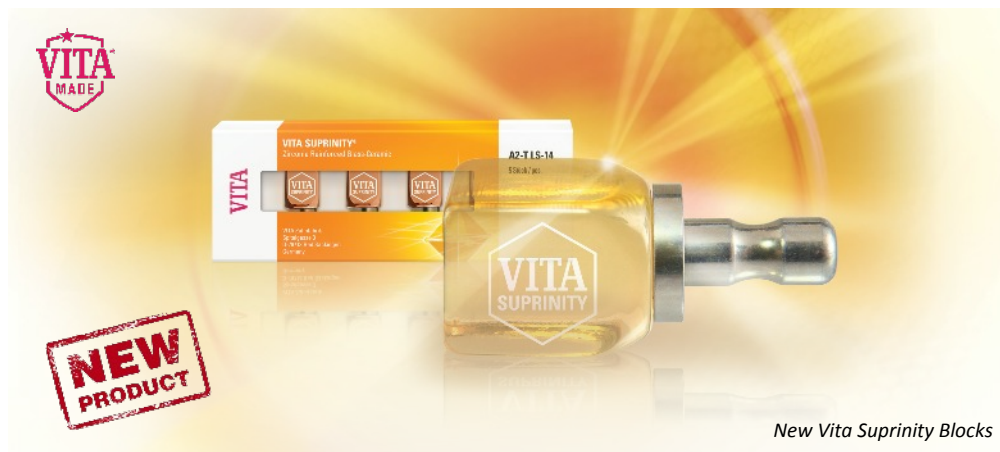
New Vita Suprinity Blocks