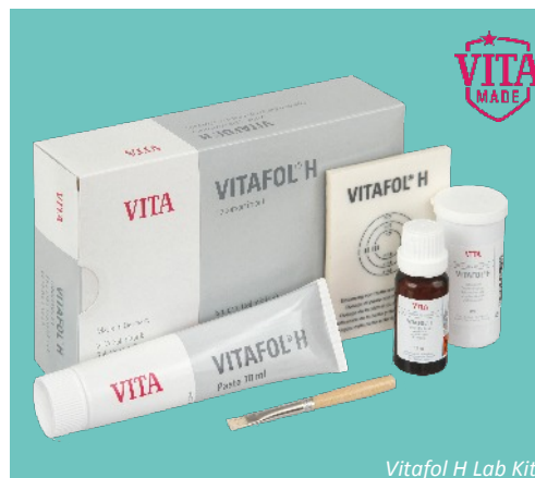
Vitafol H Lab Kit

*** Particle size is 0.5 micron compared to 1 micron in other versions. Means less bur wear and better finish