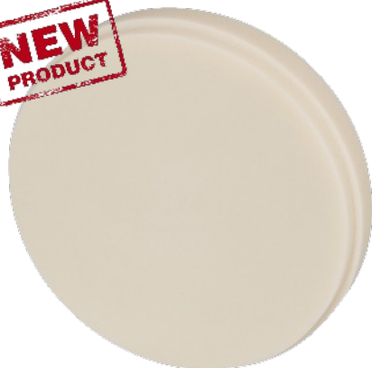
New Composite Disc

Panadent is pleased to be able to present new Zirconia reinforced Composite Discs.