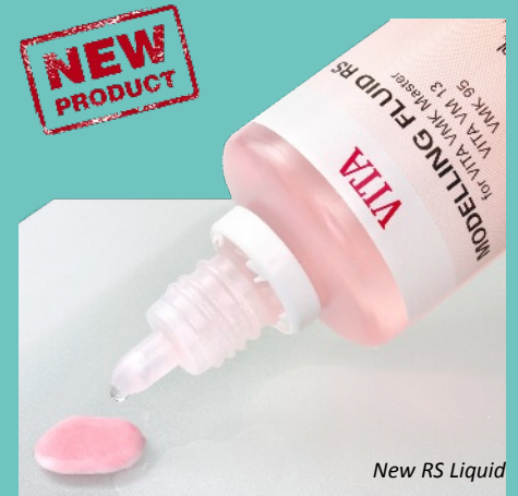
New RS Liquid

Or ask us about our Roll-Over Stock Offer of 120 sets or more for those labs wishing to use Vita teeth and have some stock in the lab. The more you buy the more stock we provide. Ask us for a no commitment quotation to find out how well you can save!